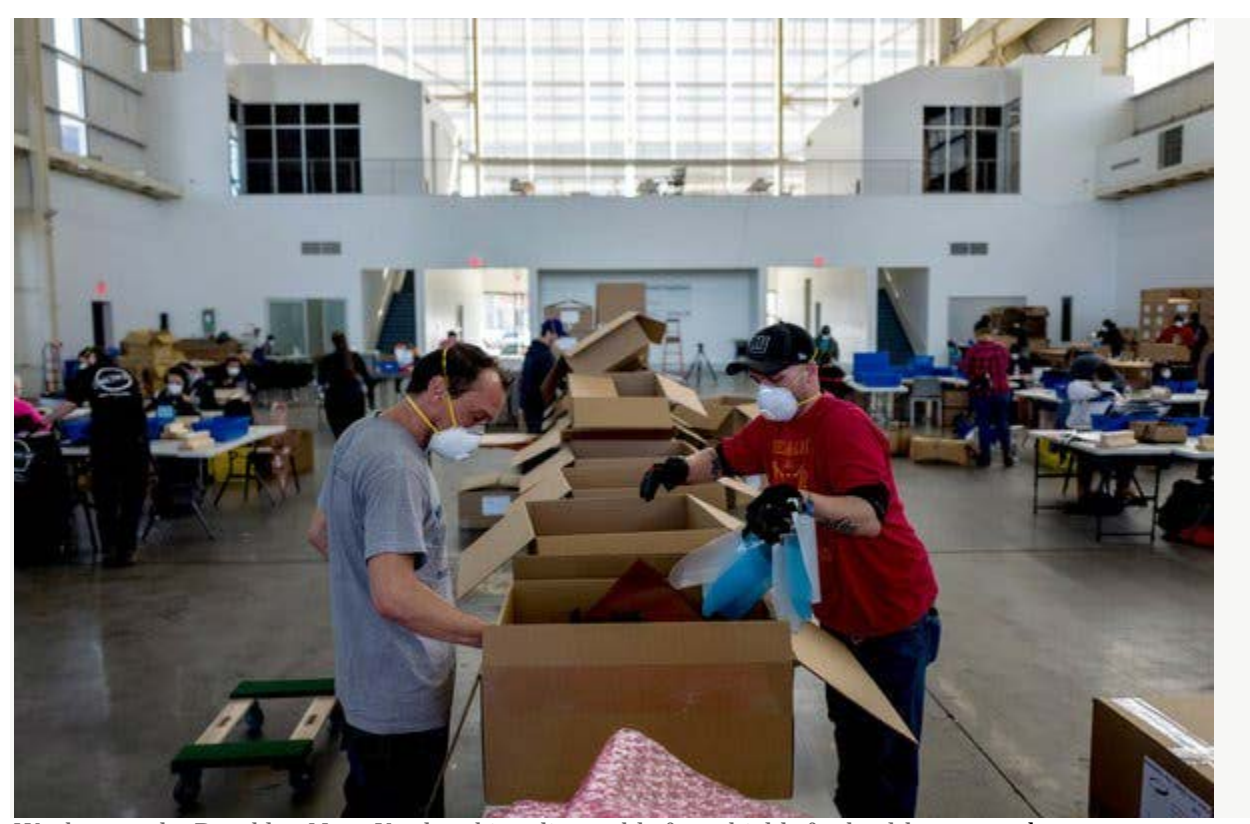
Workers at the Brooklyn Navy Yard making disposable face shields for health care workers.

The old Navy Yard's manufacturers, including printers and distillers, have pivoted to making urgently needed face shields and hand sanitizer.